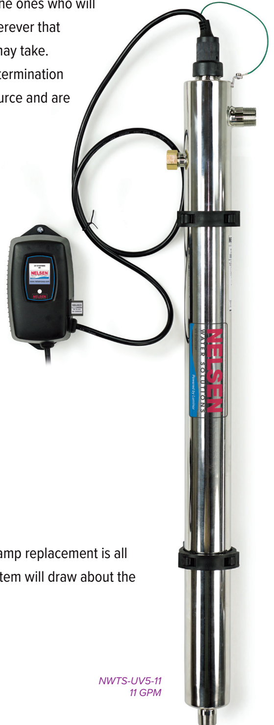
NWTS-UV5-11 11 GPM

As long as proper pre-treatment is maintained, an annual system check-up and lamp replacement is all that is required. The UV system is designed to be left on; a typical household system will draw about the same energy as a 40 watt light bulb!